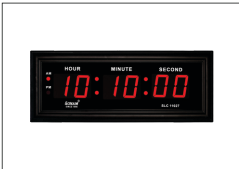
LED DIGITAL CLOCKS