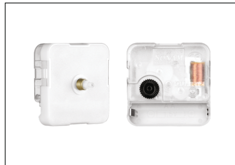
QUARTZ CLOCK MOVEMENT