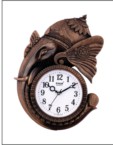
GANESH GIFT ARTICLE