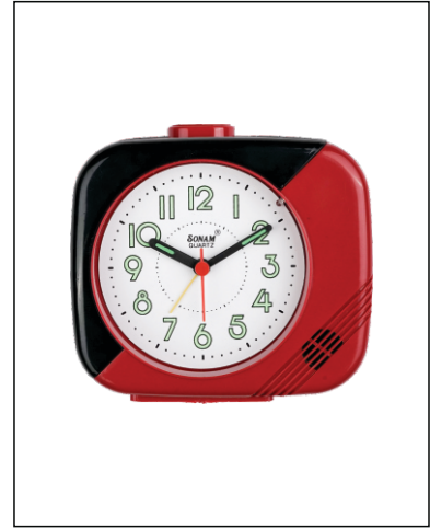
ALARM TIME PIECE